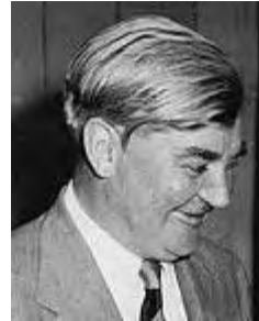
Aneurin Bevan: Deputy Leader of the Labour Party 1959 to his death in 1960, Member of Parliament representing Ebbw Vale for 31 years and most famous for spearheading the establishment of the National Health Service in post-war Britain in his role of Minister of Health.