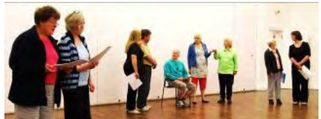
Students at last year's Summer School in action.

Full details will be launched very shortly on our website www.dramawales.org.uk and will be featured in next month's E-newsletter.