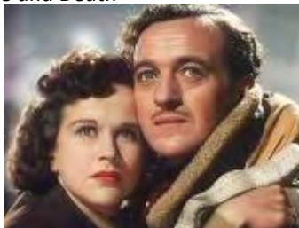
David Niven and Kim Hunter in A Matter of Life and Death